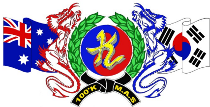
100K Martial Arts System